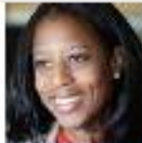
Jason Chaffetz (R)